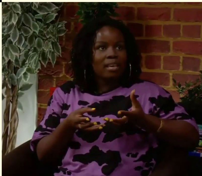
aidsmap LIVE 2019, HIV & Mental Health