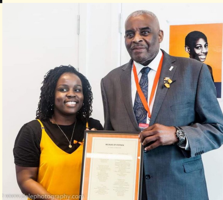
With Dr Neville Lawrence, after the commemoration of the inaugural National Stephen Lawrence Day